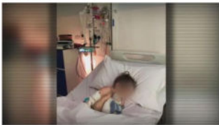
A rare disease could be linked to COVID-19 in children.